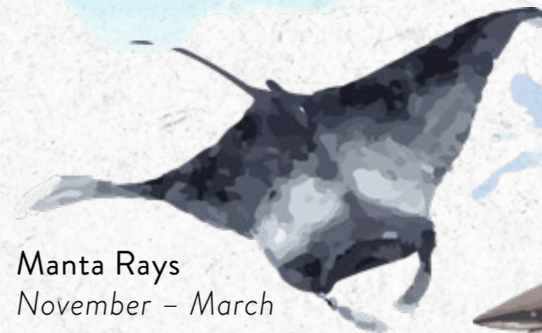
Manta Rays November – March