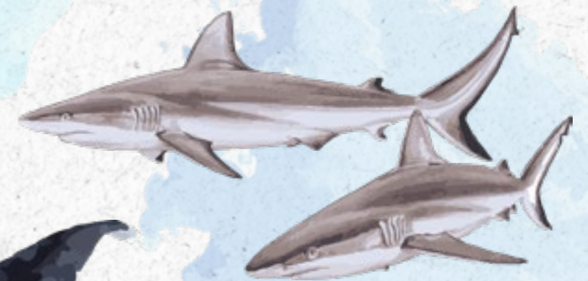
Grey Reef Sharks